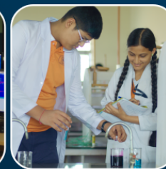
Modern Classrooms & Labs