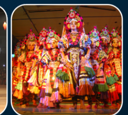
Cultural & Spiritual Activities