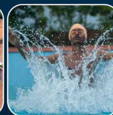
Yoga, Sports & Swimming