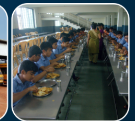
Library, Transport & Food Facilities